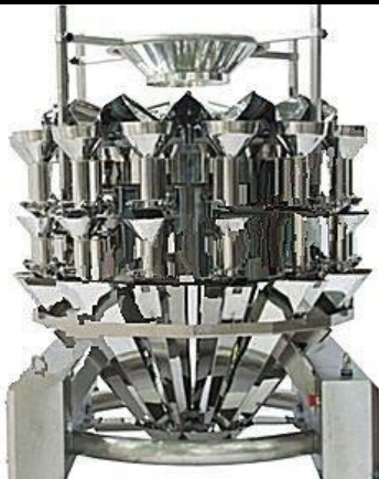
10 & 14-HEAD Stick

Full line of high speed Multi-Head Combination Scales that are very accurate and available in different configurations to integrate with any packaging equipment. Mount over one or two automatic pouch machines, Vertical Form Fill and Seal Machines or Semi-Automatic Filling applications.